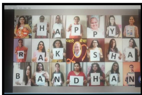
(Screenshot of Rakshabandhan Program)