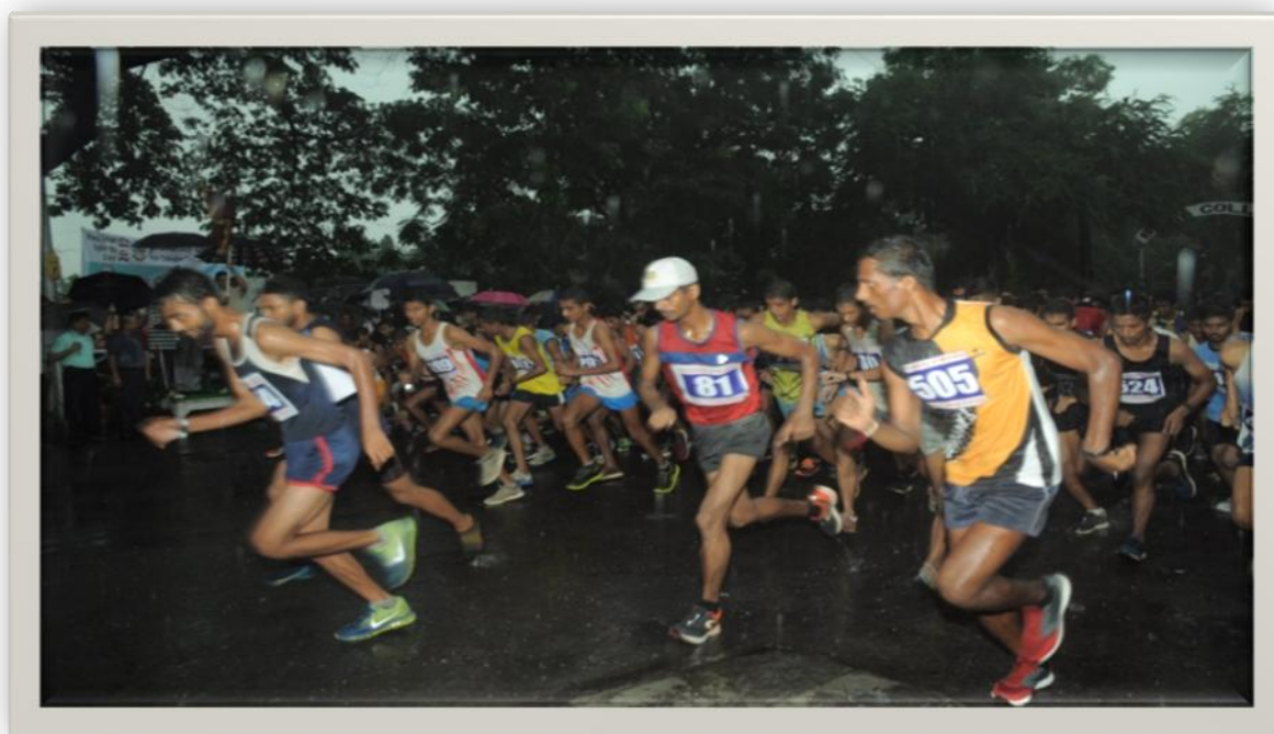
Active participation of student's in spite of heavy rains