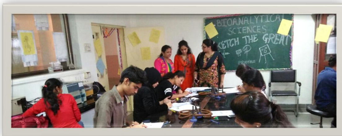
Students involved in sketching