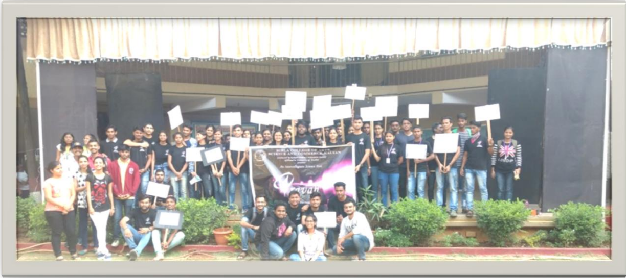
Students energized for Pravah

The grand event was a successful which helped the students to develop there organizing and management skills. This activity stimulated innovative thinking and also boosted students' interpersonal relationship and gave them a training of working in a team.