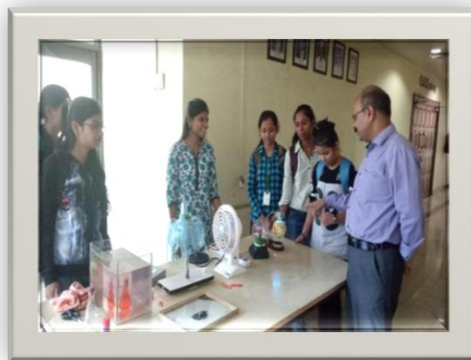
Demonstration by IIG Researchers