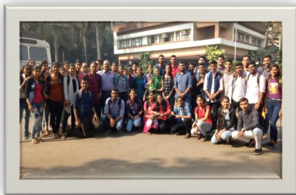
B.Sc. (Physics) students at IIG Panvel Campus

The students reached back to College at 7 pm.