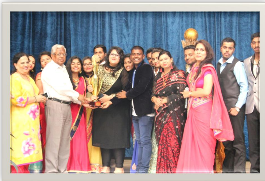
Winners of 'Best Class' Award

The Mentor along with her event committee left no stone unturned to organise the 5 th Student Encouragement Awards. Their hard work paid off as the students were happy, satisfied and encouraged.