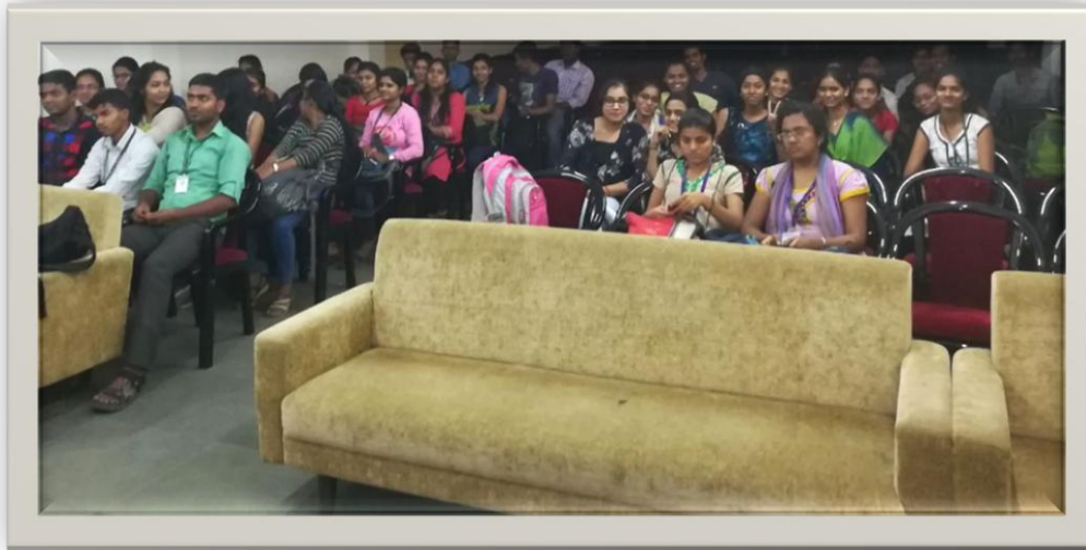
Students learning MS Excel in Skill Development Workshop