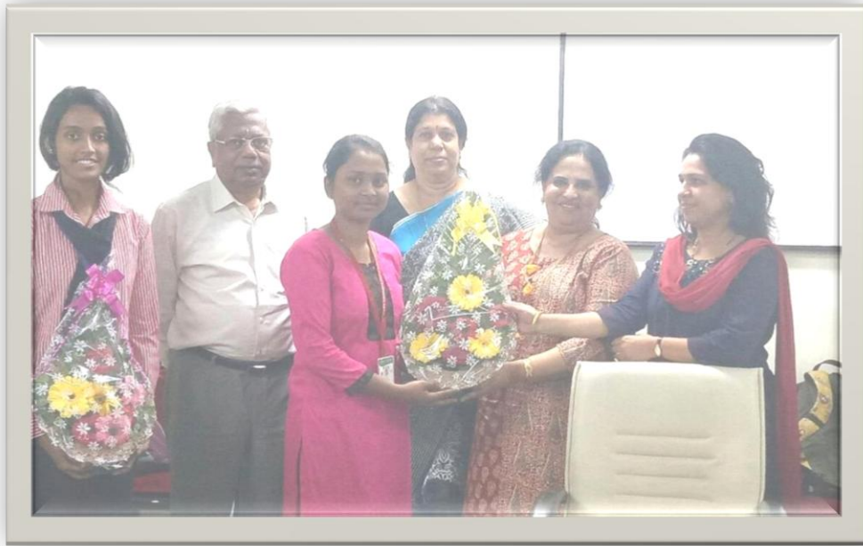
Felicitation of Secretary and Lady Representative of Students' Council