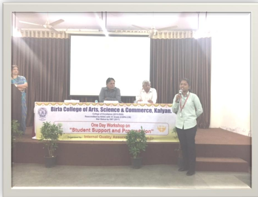
Program on Students Support and Progression