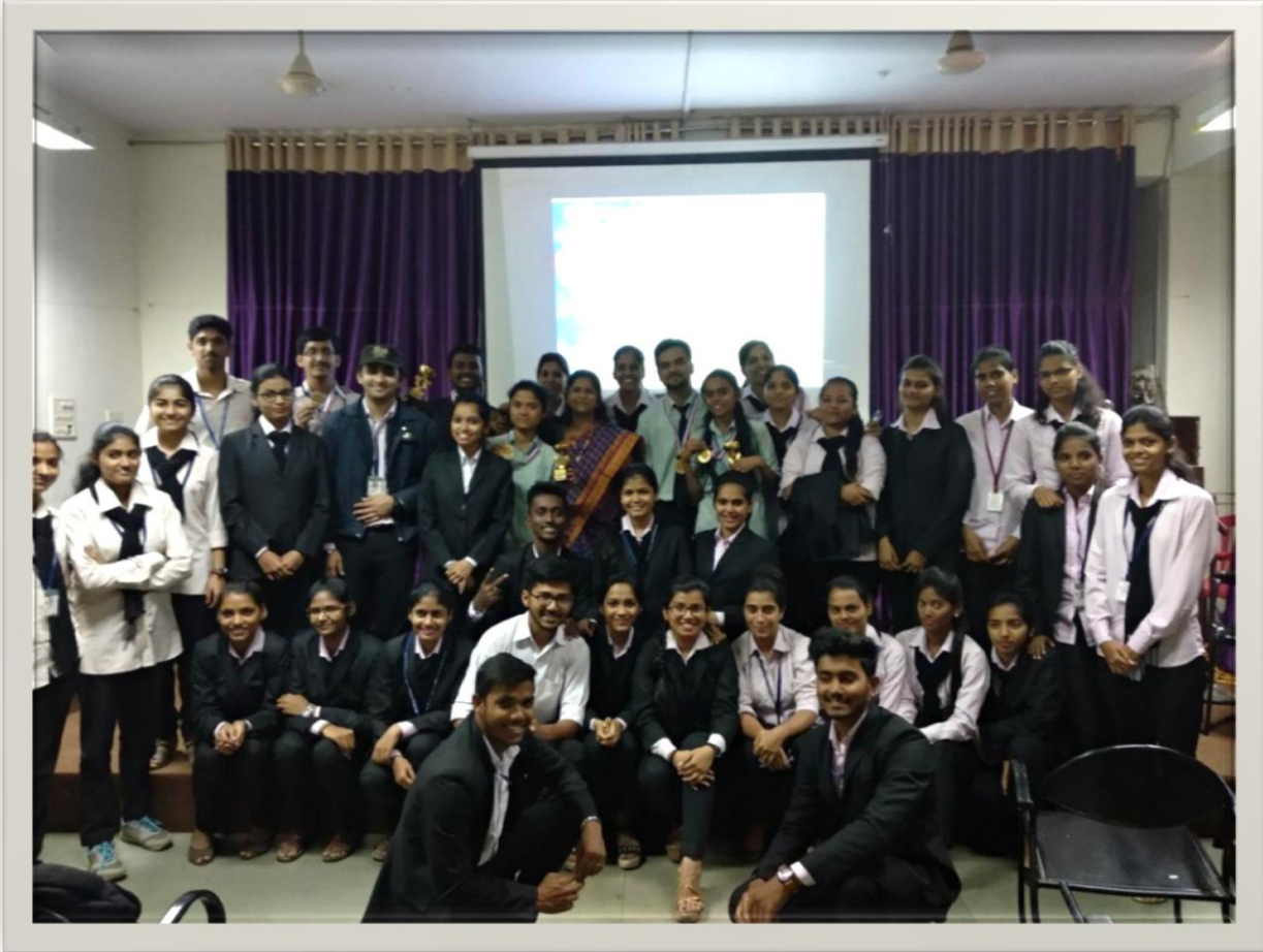
Award winners of Intra-Collegiate Competition